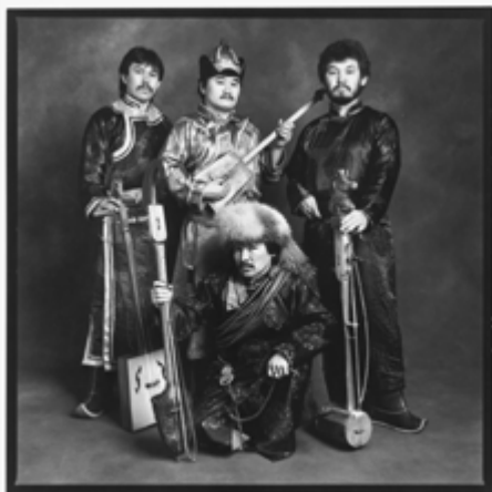
Huun-Huur Tu -- Throat Singers of Tuva (See and Hear the World music series).

Once again, the CMC came to life through a dynamic programme of performances and public participation activities. Key