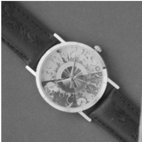
The Morning Star watch.