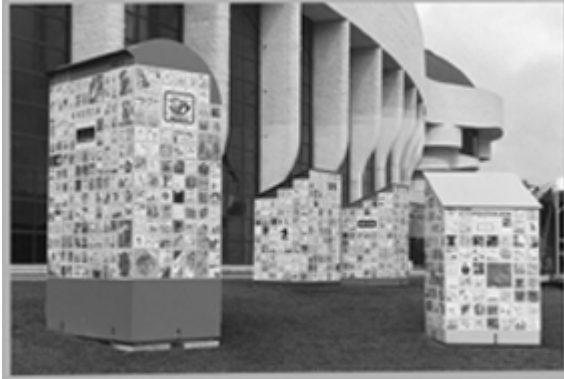
Giant mailbox sculptures.